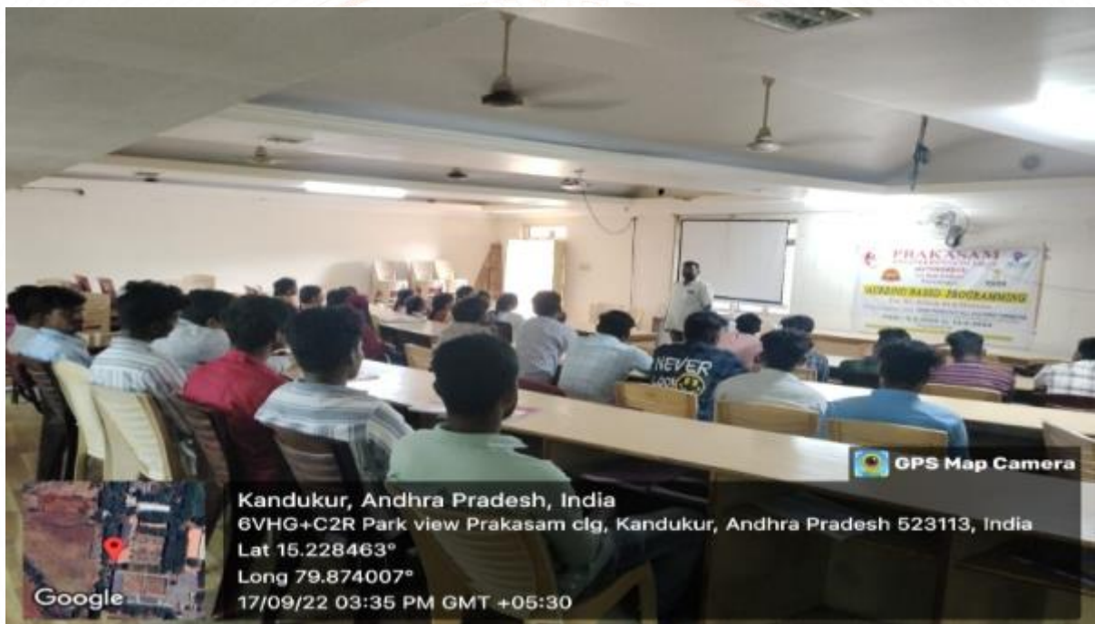
Seminar Class for High Rise Building Construction