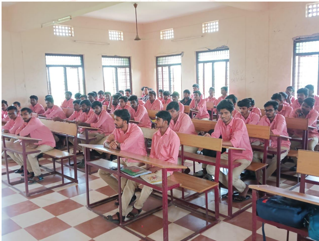
PHOTO GALLERY Three Day Workshop on Entrepreneurship Awareness Camp for Boys 12-11-2019 To 14-11-2019