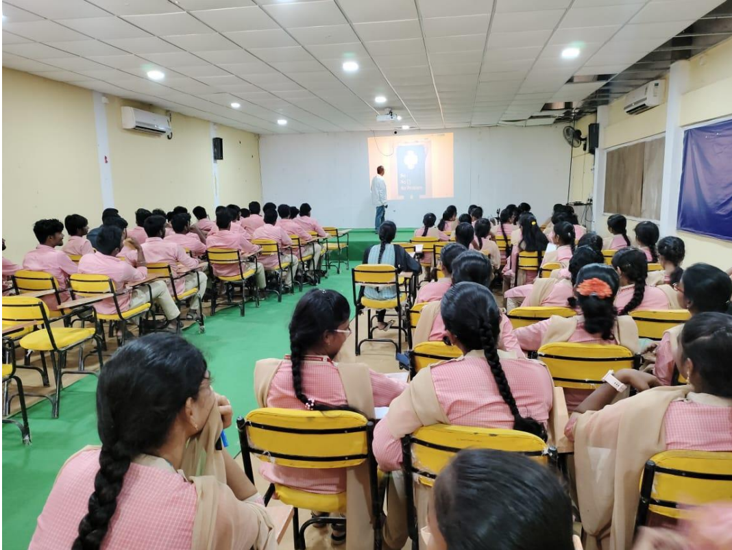
Students at a glance in the seminar Hall for attending Embedded Systems and Its Research Applications