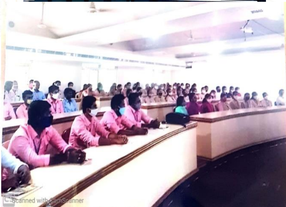
Five Days Workshop on Printed circuit Board Design And Manufacturing