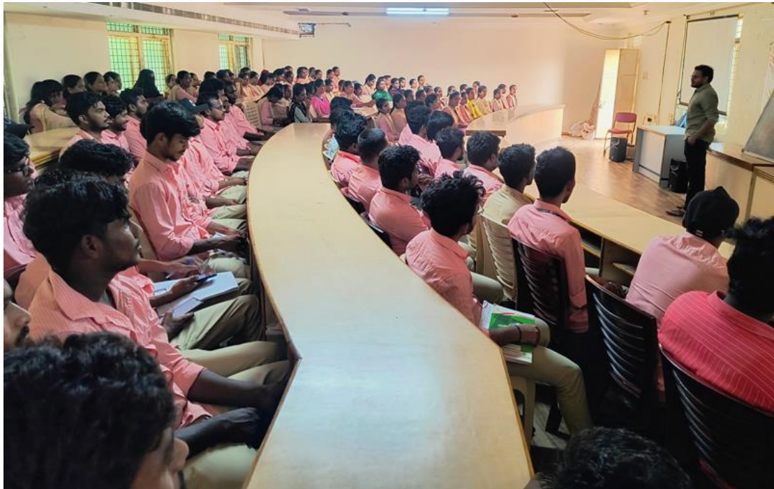
Public speaking skill development and contest on 1-8-18