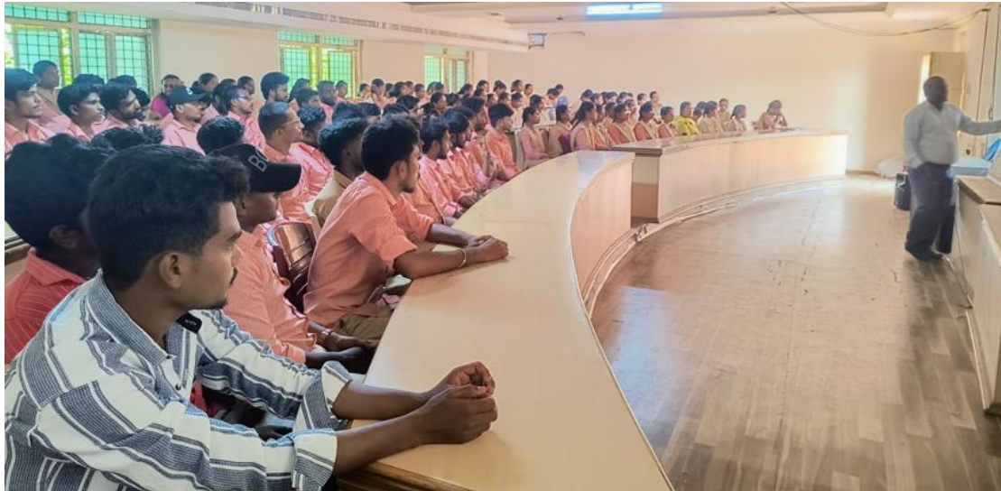
Recitation skills development through poetry recitation training on 30-06-18