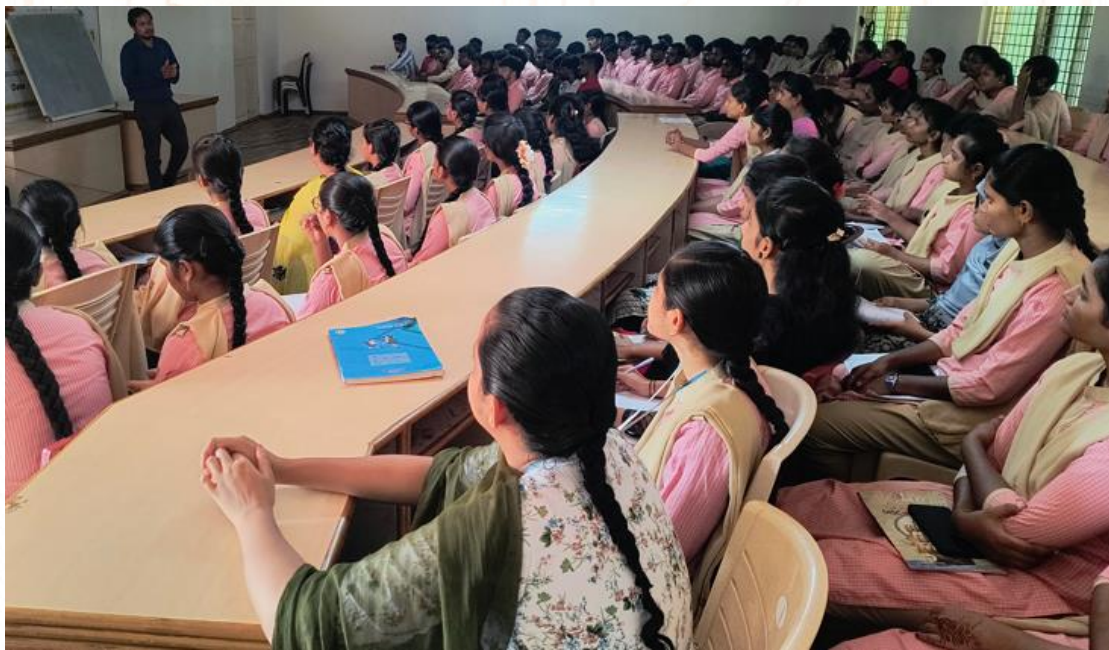
Enhancing essay writing skill with practice test on 18-03-19